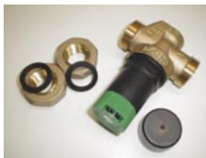
Pressure regulating valve (#MIXXPRV.1)